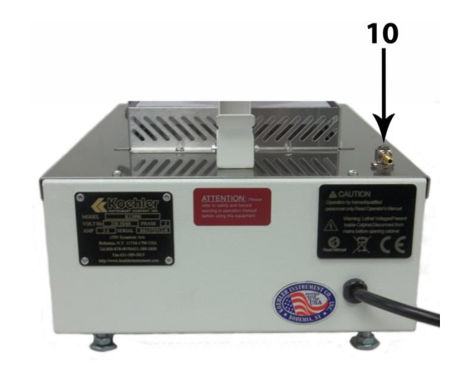
Figure 2: Instrument Descriptions_Back

10. Gas Inlet: For connection to source gas. Connect the gas inlet to a regulated low pressure gas supply (0.5 to 1.0 psi). Use only propane, LPG, or natural gas. Do not use direct unregulated pressure from an LPG tank.